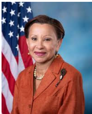
Rep. Nydia Velazquez New York 7th District Democrat

2302 Rayburn House Office Building P: 202-225-2361