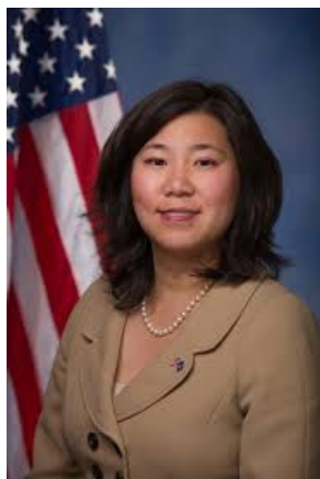
Rep. Grace Meng New York 6th District Democrat

2209 Rayburn House Office Building P: 202-225-2601