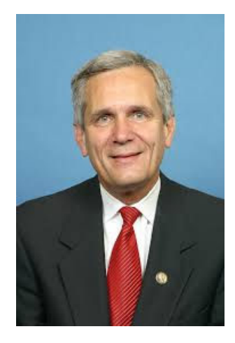
Rep. Lloyd Doggett Texas 37th District Democrat

2307 Rayburn House Office Building P: 202–225–4865