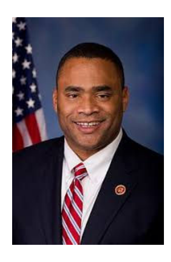
Rep. Marc Veasey Texas 33rd District Democrat

2348 Rayburn House Office Building P: 202-225-9897