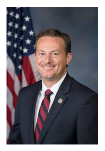
Rep. Michael Cloud Texas 27th District Republican

171 Cannon House Office Building P: 202–225–7742