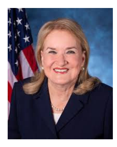
Rep. Sylvia Garcia Texas 29th District Democrat

2419 Rayburn House Office Building P: 202–225–1688