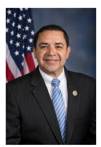
Rep. Henry Cuellar Texas 28th District Democrat

2372 Rayburn House Office Building P: 202–225–1640