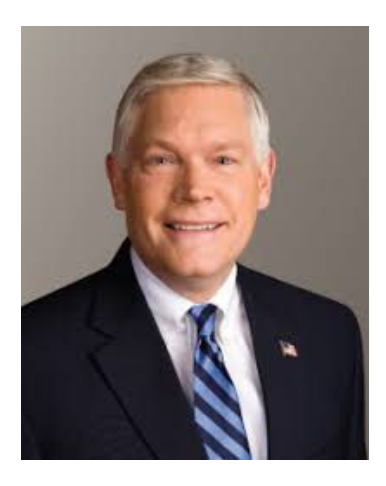
Rep. Pete Sessions Texas 17th District Republican

2204 Rayburn House Office Building P: 202–225–6105