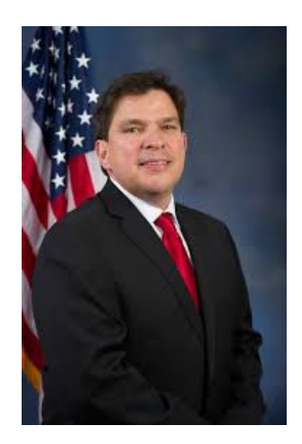
Rep. Vicente Gonzalez Texas 34th District Democrat

154 Cannon House Office Building P: 202–225–2531