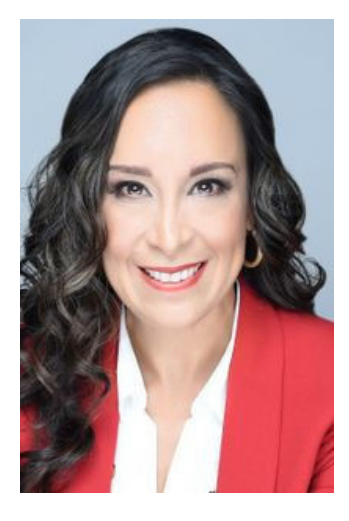
Rep. Monica De La Cruz Texas 15th District Republican

1415 Longworth House Office Building P: 202–225–9901