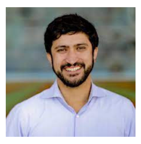
Rep. Greg Casar Texas 35th District Democrat