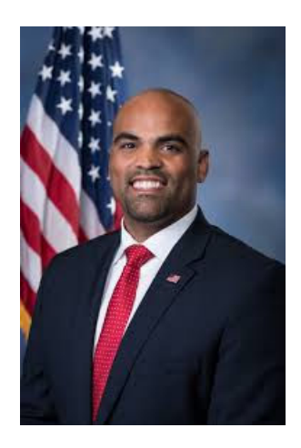
Rep. Colin Allred Texas 32nd District Democrat

348 Cannon House Office Building P: 202–225–2231