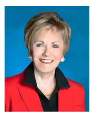
Rep. Kay Granger Texas 12th District Republican

2308 Rayburn House Office Building P: 202–225–5071