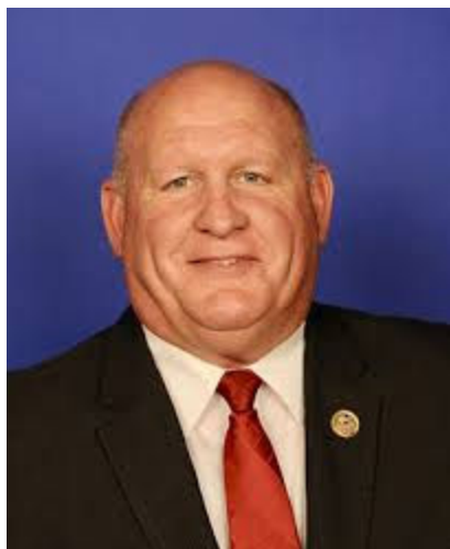
Rep. Glenn Thompson Pennsylvania 15th District Republican

400 Cannon House Office Building P: 202-225-5121