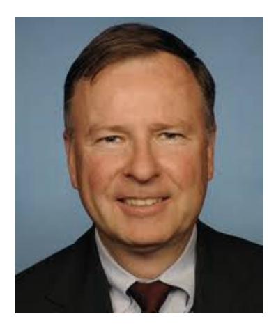
Rep. Doug Lamborn Colorado 5th District Republican

2371 Rayburn House Office Building P: 202–225–4422