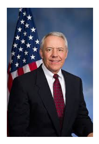
Rep. Ken Buck Colorado 4th District Republican

2455 Rayburn House Office Building P: 202–225–4676