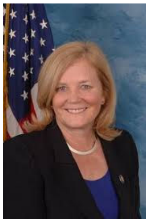
Rep. Chellie Pingree Maine 1st District Democrat

2354 Rayburn House Office Building P: 202–225–6116