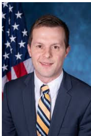
Rep. Jared Golden Maine 2nd District Democrat

1710 Longworth House Office Building P: 202–225–6306