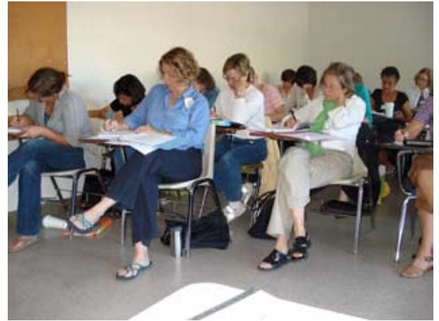
San Francisco Bay Area Teacher-Writers trying out a fluency prompt that they will use with their students

A comprehensive guide to teaching writing fluency is available in a book I wrote with Gerald Fleming. Rain, Steam & Speed: Building Fluency in Adolescent Writers is available through Jossey-Bass