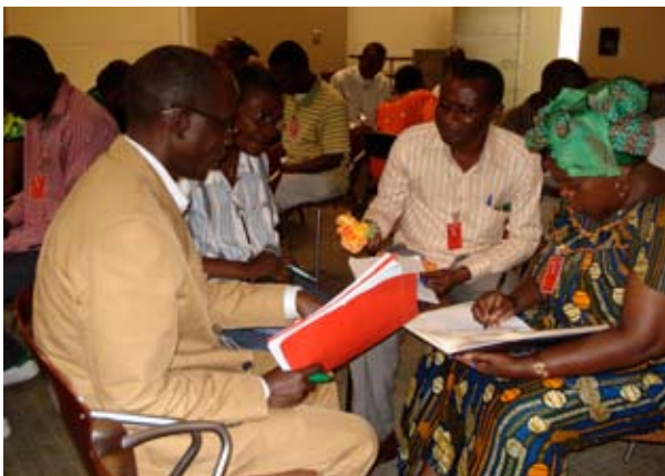
Educators in Brazzaville, Congo practicing their fluency in English

( http://www.josseybass.com ) and includes a step-by step guide explaining how to set up a fluency program for your writing students, 150 fluency prompts and an annotated discography of musical selections that are an important feature of this program. A review of the program in action was featured in Edutopia and can be accessed at http://www.edutopia.org/blog/writing-fluency-classroom-elena-aguilar . If you have questions or comments about developing fluency in your students, contact Meredith Pike-Baky at mpikebaky@mac.com .